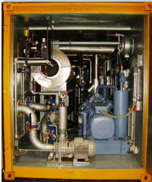
40 ft container with CO 2 / NH 3 soil-freezing containerised refrigeration system