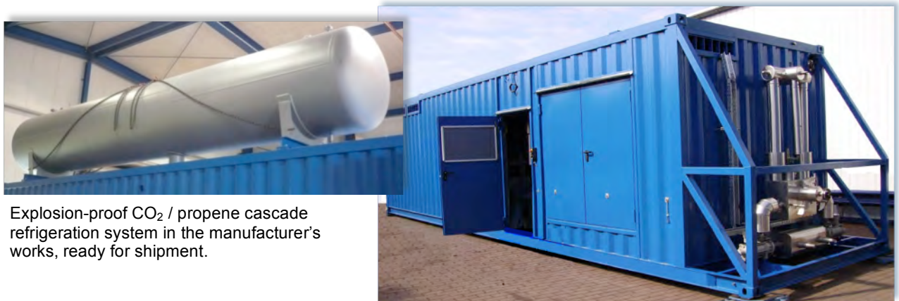
Explosion-proof CO 2 / propene cascade refrigeration system in the manufacturer's works, ready for shipment.

The high cascade stage is condensed by cooling water which is supplied from the customer's network.