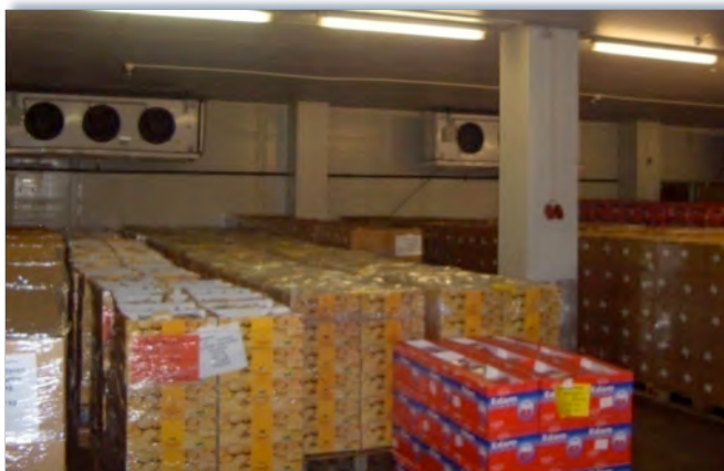
Storage of milk products at 2°C - 4°C in a cheese plant