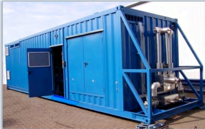
CO 2 / propene cascade refrigeration system in a container

A 40 ft special container houses a complete CO 2 / propene cascade refrigeration system which cools a re-condensing system in the chemical industry.