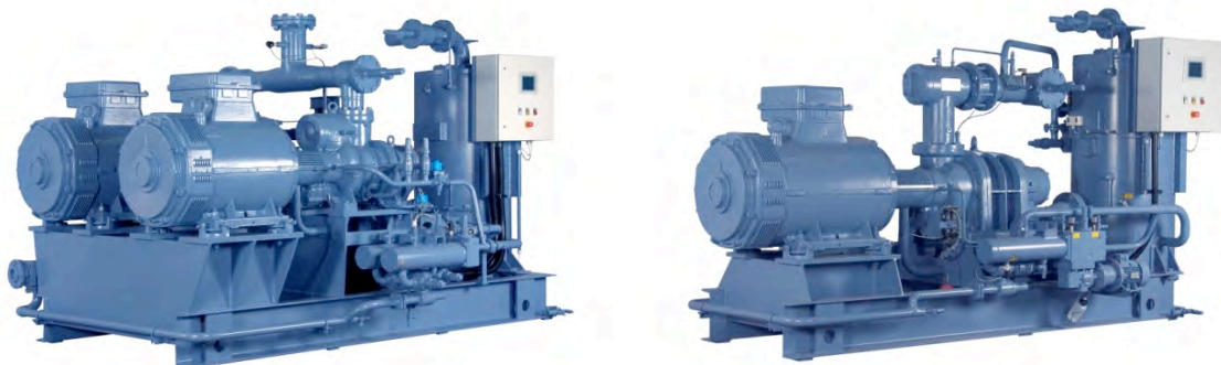
Prefabricated compressor base frame units from GEA Grasso: DUO ND 5A (left), Single SB 2A (right)

After assembly every refrigeration system in container design makes at least one journey. Therefore ARCTOS prefers to employ prefabricated compressor units on base frames. They have high stability and rigidity and are supplied ready to install.