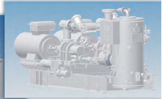
Container including NH 3 -Duo compressor set as unit

The over ground NH 3 refrigeration system cools the brine needed for freezing the soil. Deep pilot tunnels (freezing lances) are drilled into the soil to be frozen and the brine is pumped in. The -38°C brine freezes the soil around the drilled freezing lances. Construction work can be done without risk of static damage. When construction work is finished, the refrigeration system can easily be relocated to another site.