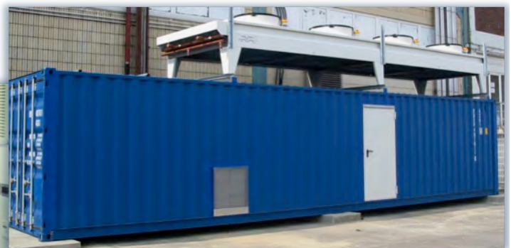
Ten production and storage rooms are maintained at different temperatures using an air-cooled R404A dual purpose refrigeration system.

The temperature ranges from -20°C to +10°C.