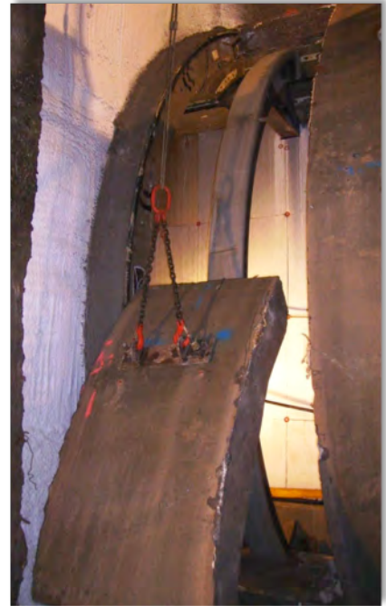
Frozen soil (white) surrounding a tunnel which has been opened under protection of the ice shield in order to be connected with an underground railway station.

Soil freezing enables building projects which could not be realised in the past or where costly liquid nitrogen freezing was applied for a long time.